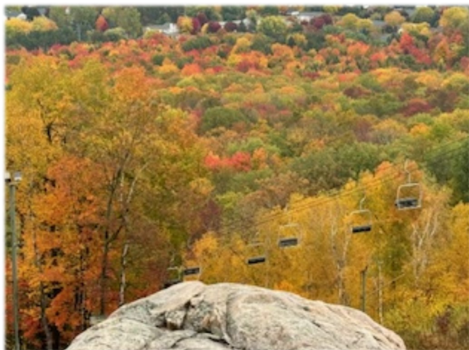
The beautiful fall colors of Rib Mountain which is part of the Wausau landscape!