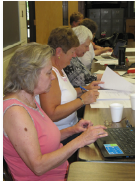
The convention committee is meeting monthly to plan an engaging convention.

Are you getting excited about convention? These ladies certainly are!