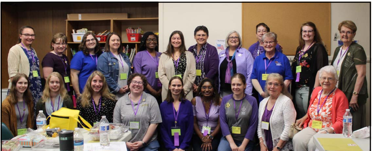
The new LWML SWD Young Women Representatives and some of their avid supporters.