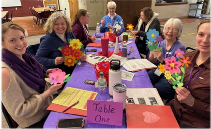
Ladies showing the flowers and bouquets they made that represent leadership attributes that they are strong in or would like to grow in