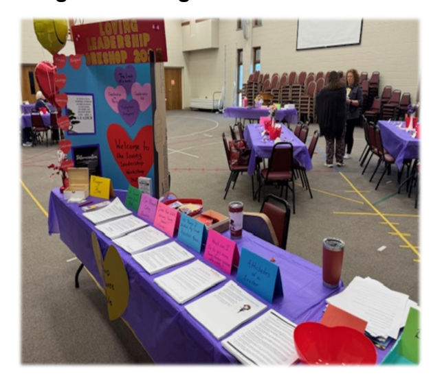
Leadership Resource Table (More pictures on the next page)

Loving Leadership isn't just about how you treat others — it's also about how you see yourself in leadership. It's about learning to love the responsibility, the impact, and the privilege of leading others.