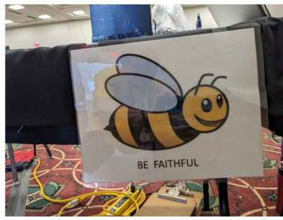
The Worker's Room was called "The Hive!" where our busy-bee workers buzzed around answering countless questions.